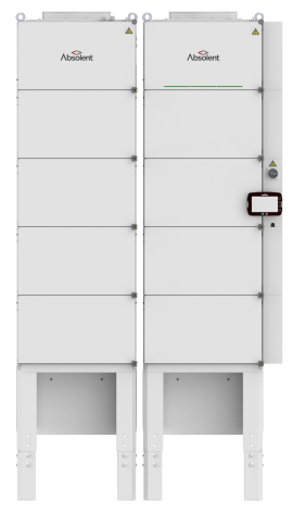
Sub & Main

There are two types of filter units in the A•erity concept: Main and Sub units. The main unit controls all fans in the system.