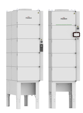
Tandem & Single

A \bullet erity Single consists of one unit and A \bullet erity Tandem consists of two units with a common bottom module. The same airflow can be achieved with a Tandem as with two interconnected Single units. Single and Tandem can be both Main and Sub units.